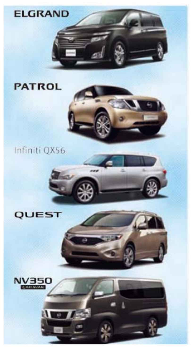
Exhibited at the 42nd Tokyo Motor Show 2011